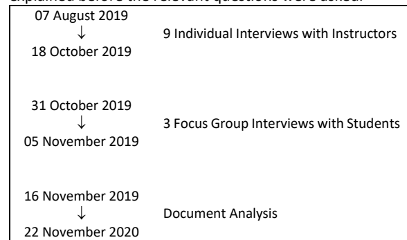
Figure 1. Research Flow Diagram

interview room. Individual interviews took approximately 30 min. The students were briefly informed about the research during a break. The contact information of the students interested in participating in the study was obtained, and a group was established on the social media platform to continue communication. Then, at the face-to-face meeting with the students on the specified day and time, they were informed in detail about the research, their questions were answered, and they were invited to participate in the study. The interviews were conducted face-to-face in lecture halls or laboratories at the Faculty of Nursing. A graduate student (B.C.) attended the interviews to take notes and create an objective atmosphere—this student had no relationship with the students involved in the focus group interviews. Focus group interviews were approximately 1.30 hours in length. All interviews were audio recorded. 360-degree assessment was briefly explained before the relevant questions were asked.